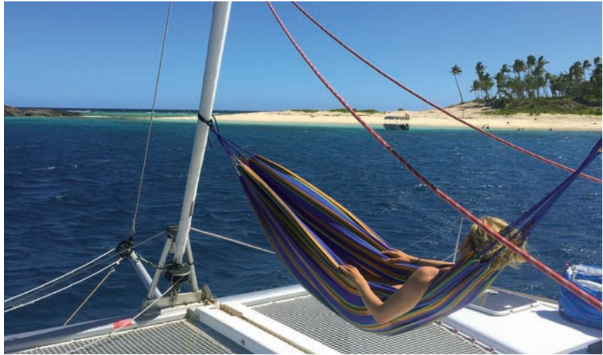
all that remains is to thoroughly enjoy your trip...

For medical training and marine medical kits , please contact MEDIDISTANCE at medidistancesante@gmail.com Other similar organizations exist in most countries, whether private entities or official departments. Advice on where to find training can be obtained from the likes of the RYA in the UK or the SSCA in the USA or others in different countries. For calling for medical help when you are at sea, initial contact can be made with the nearest coastguard, wherever in the world you are.