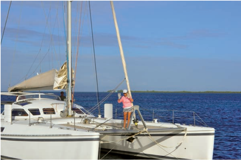
Prevention: the key word. Wearing gloves and shoes is imperative when anchoring.