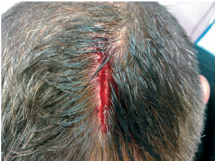
Head injuries: often from the most benign incidents.

For medical training and marine medical kits , please contact MEDIDISTANCE at medidistancesante@gmail.com Other similar organizations exist in most countries, whether private entities or official departments. Advice on where to find training can be obtained from the likes of the RYA in the UK or the SSCA in the USA or others in different countries. For calling for medical help when you are at sea, initial contact can be made with the nearest coastguard, wherever in the world you are.