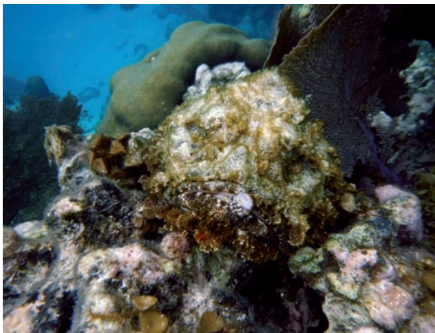
Stonefish: a camouflage king with a terrible sting!

When a sailor needs medical advice or consultation, he or she directly contacts the Medical Assistance Service (TMAS) or through the Coastguard MRCC. As with most countries, in France, the Center for Maritime Medical Consultations (CCMM) is reachable 365 days a year and 24 hours a day. It is advisable to seek their advice for anyone who is ill, injured,