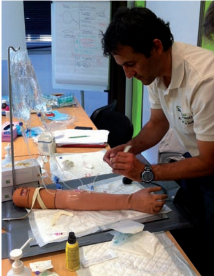
Offshore Medical Training - Preparation for the Vendée Globe race.