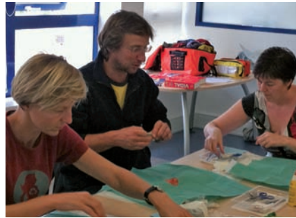
Prospective cruisers undergoing some medical training...